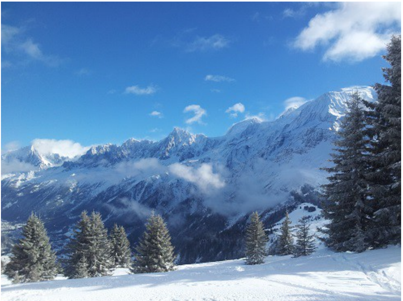
Vue depuis Les Houches