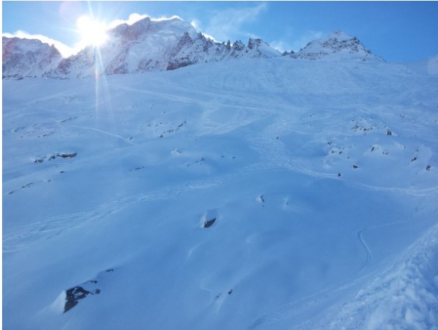
Traces aux Grands Montets