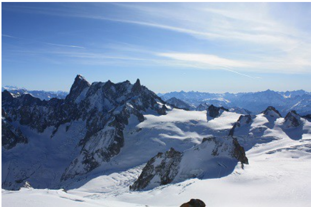
Les Grandes Jorasses & la vallée blanche