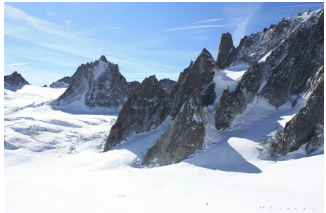
La Tour Ronde & le grand capucin