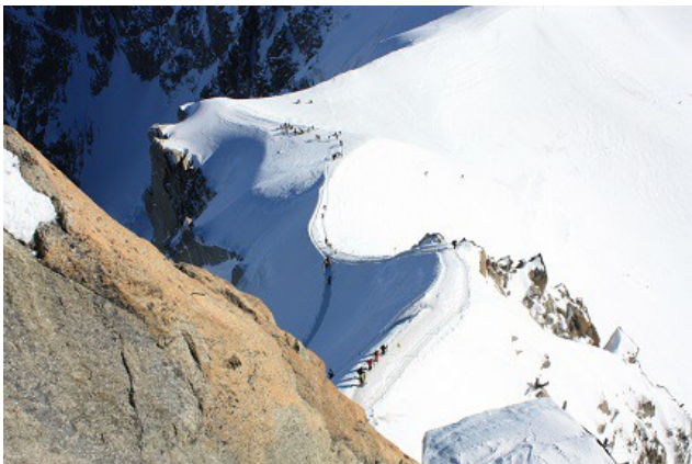
Arête de l'Aiguille du Midi