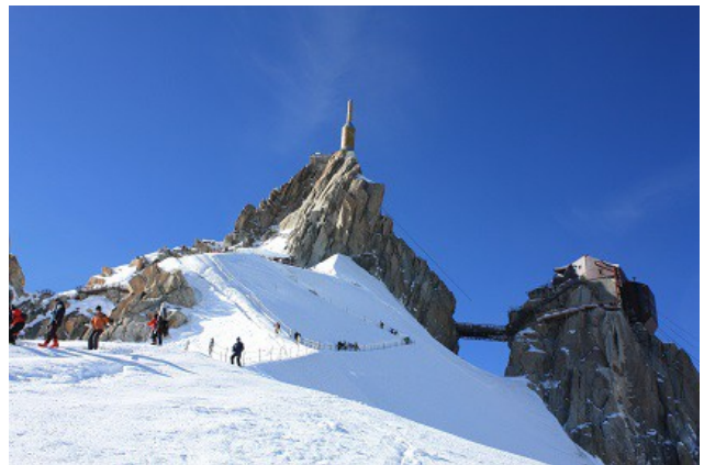
Arête de l'Aiguille du midi