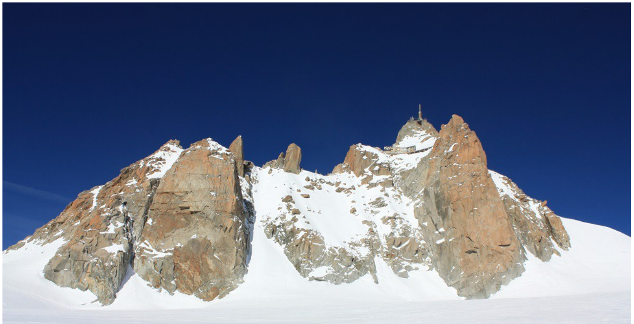
Aiguille du Midi from the Vallée Blanche