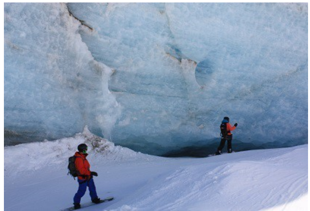
Flozen canyon in the vallée blanche